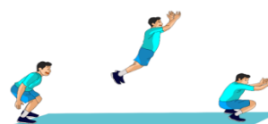
Figure 3. Illusion of the standing board jump test

The child's result is measured from the previous landing of the body or limb closest to the starting line, the value that the child is allowed to be the farthest jump distance obtained from the three jumps in centimeters (cm)