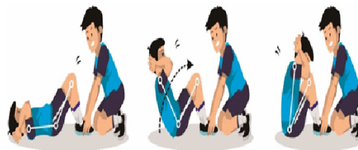
Figure 1. Sit-Up

The correct number of Sit-Up movements, which people can try.