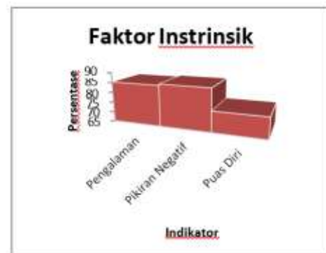
Figure 1. Intrinsic Aspects

events, distributions, and relationships between sociological and psychological variables are found. The sample in this study is those who are members of PSHT pencak silat athletes in Sumber Jaya Village, which only number 15 people (Sugiyono, 2019, p. 2; Sugiyono, 2019, p. 24).